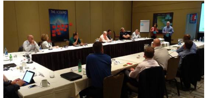
Project Client Insight in action.

Those that participated with us in Chicago demonstrated incredible teamwork, openness and energy toward designing the future of remarketing, and many have already been supportive in the follow up work associated with each of the projects named above. AutoIMS is truly grateful for the commitment of all of our clients, and looks forward to announcing progress on these initiatives soon.