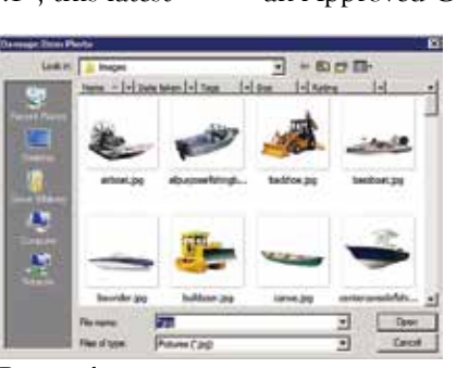
Browse for images

All AutoIMS auctions can download version 5.1 from AutoIMS.com. Please contact Customer Service for more information, to arrange for a demo, or for assistance with the new features by calling 888-683-2272 or customer.service@ autoims.com.