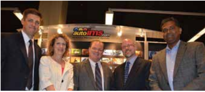
AutoIMS crew at NAAA Conference

Recent weeks provided a number of great opportunities for AutoIMS to visit member auctions, providing users a newly updated curriculum of training. Topics are always wide-ranging, and every auction visit uncovers unique challenges and opportunities on which to focus. Some of the most widely requested areas for training include: