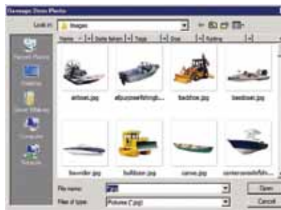
Browse for images

The first improvement makes the process of uploading photos much easier. A new, straightforward options menu prompts users to set their photo upload preferences in an ordered manner, asking simple questions like, "Are you uploading directly from a digital camera or choosing images stored on your computer?" Multiple images can be selected and uploaded at once by holding down the control key, and matching photos with associated damages or other condition report descriptions in any order is now possible. Descriptions and images may be double-checked easily on image previews by checking a newly-added title header. As the need for more CR photos continues to rise, auction personnel will find these changes very beneficial, simplifying the upload process and saving a great deal of time.